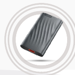
Lenovo PS6 Portable SSD